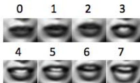
(b) Centroid of Each Cluster